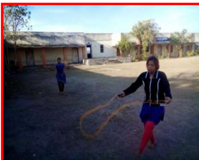
Intra-Mural tournament of Rope Skipping