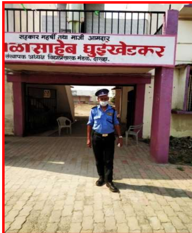
Security Guard in Internal Campus