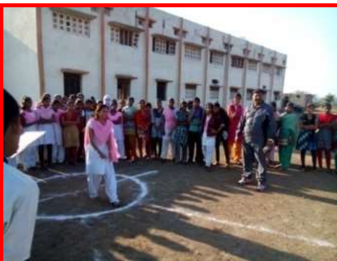
Intra-Mural tournament for Shot-Put