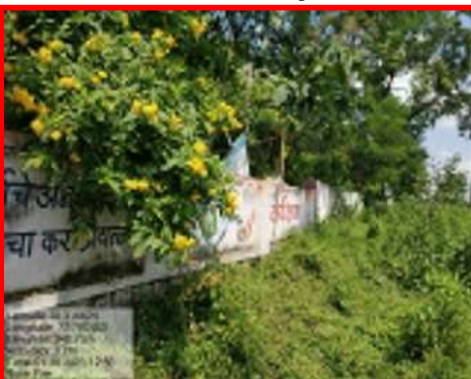
Forent Side of Campus Securedby Wall Compound