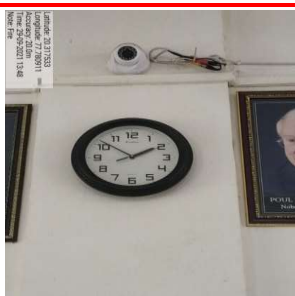
CCTV Camera in Chemistry Lab