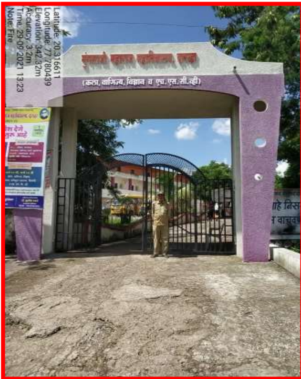
Security Guard on Entrance Gate