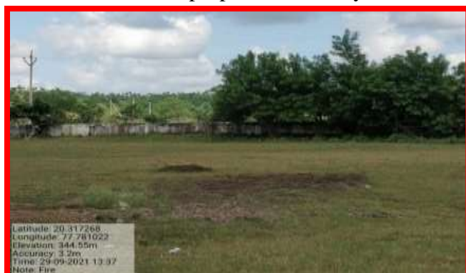
Play Ground Serounded by Wall Compound