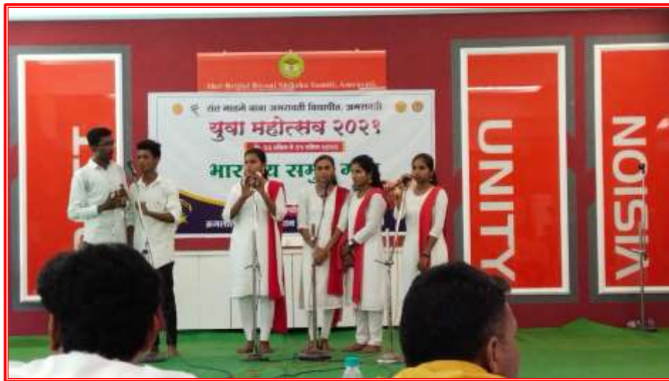
Girls Participated in Cultural Programme Rangoli making, Debate and Group Song competition in Inter Collegiate festival