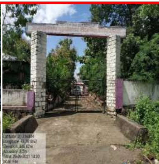
Second Entrance Gate