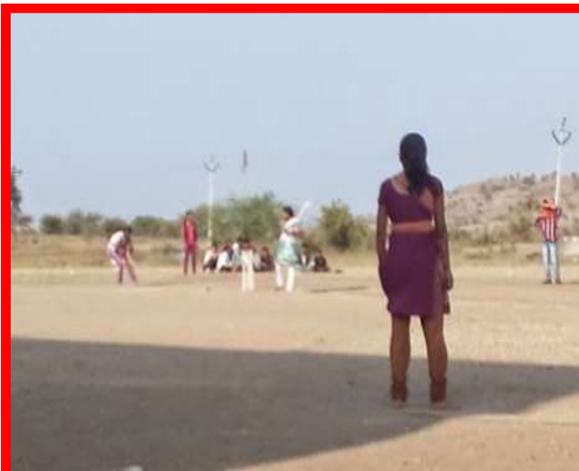
Tournament of Cricket