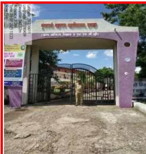
Main Entrance Gate