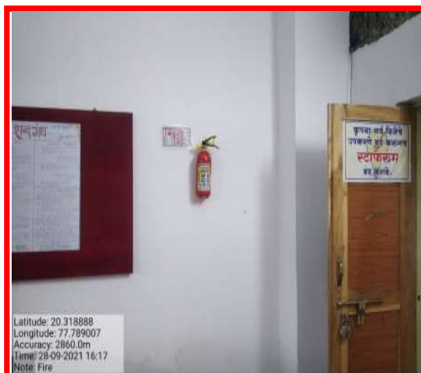
Fire extinguisher In Staff Room