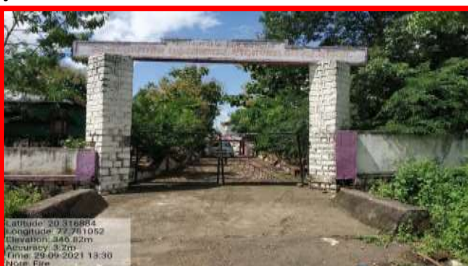
Second Gate with Wall Compound