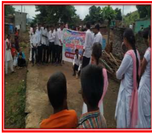
College Students present a street play