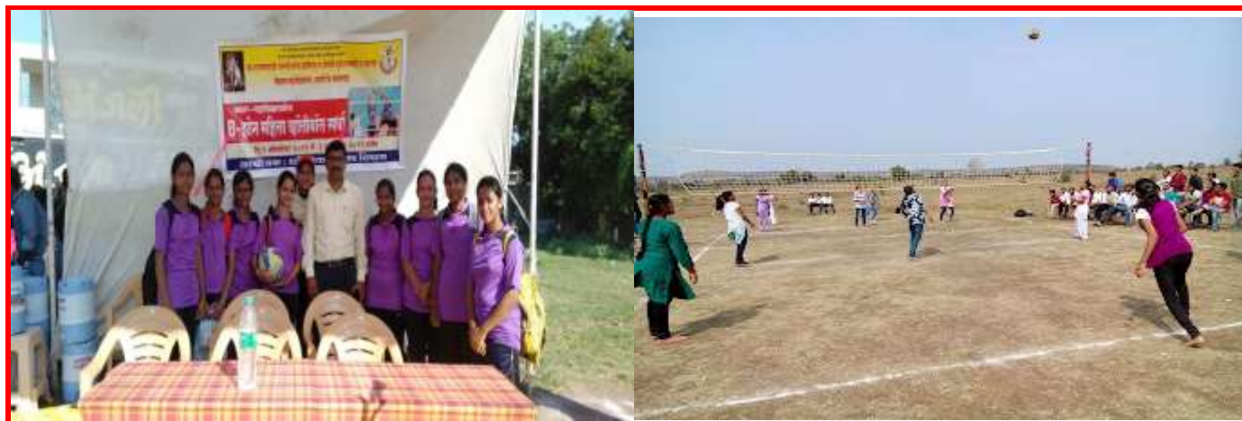
Participated in Inter Collegiate Volleyball