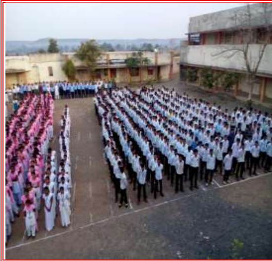
Dress Code for Students and Staff