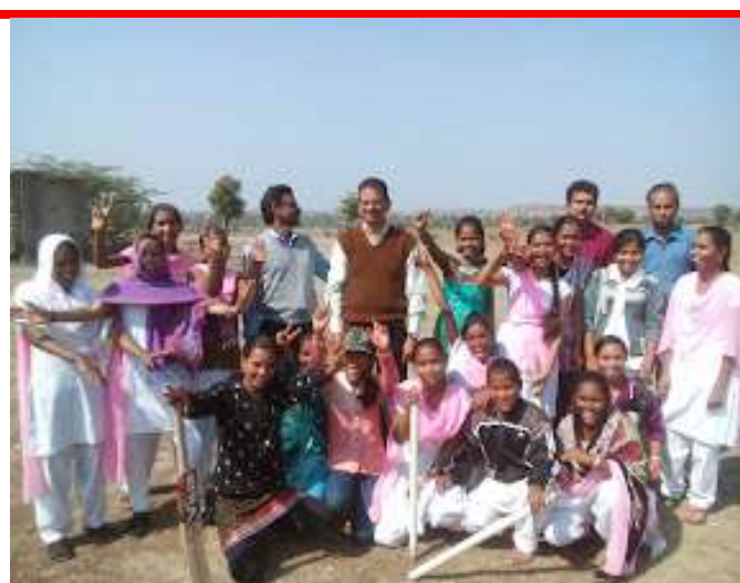
Winner Team in Intra-Mural (Cricket) with College Staff