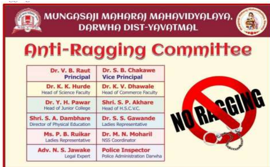
Flex Board of Anti ragging Committee in College Campus