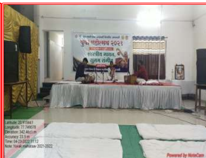
Girls Participated in Cultural Programme Dance and classical Music competition in Inter Collegiate festival