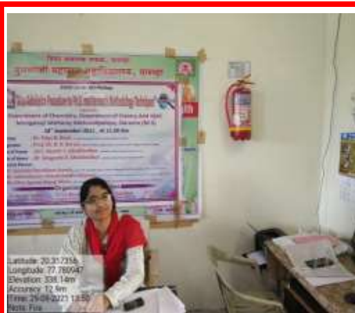
Fire extinguisher In Chemistry Lab.