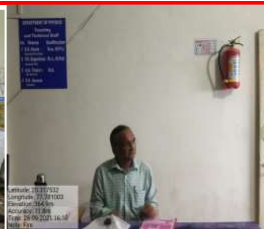
Fire extinguisher In Physics Lab.