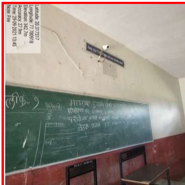
CCTV Camera in Classroom